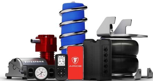
Ride-Rite, Coil-Rite, Air Command & Accessories

Air helper springs work by maximizing a vehicle's safe load-carrying capacity in most trucks. Paired with Air Command Single or Dual path wireless controls, Firestone Airide provides the complete solution to make towing and hauling a stress-free experience. For the latest list of qualifying Ride-Rite, Coil-Rite and Air Command products, please contact your sales rep.