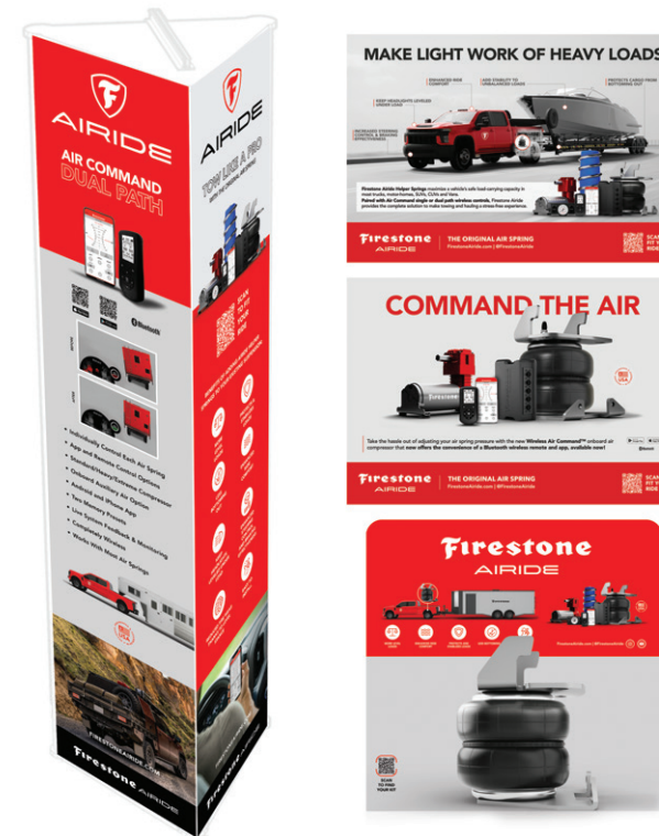
Basic & Premium POP

As an authorized dealer, you have access to class leading marketing resources. From point-of-purchase material to digital tools, Firestone Airide will provide access to tiered material based on your commitment levels.